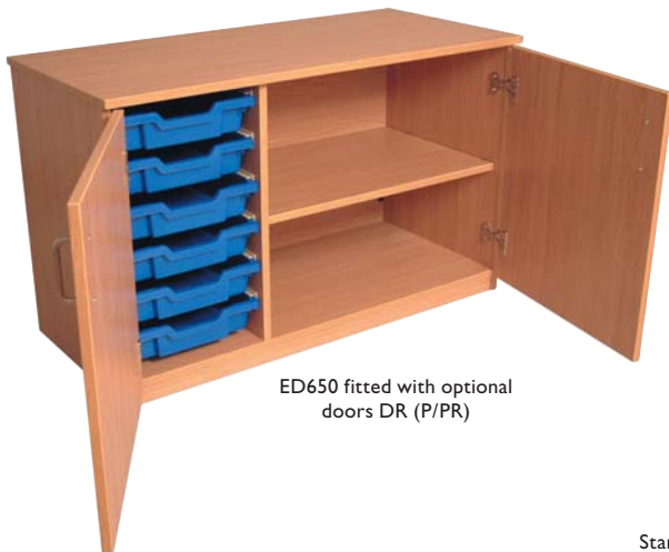
ED650 fitted with optional doors DR (P/PR)