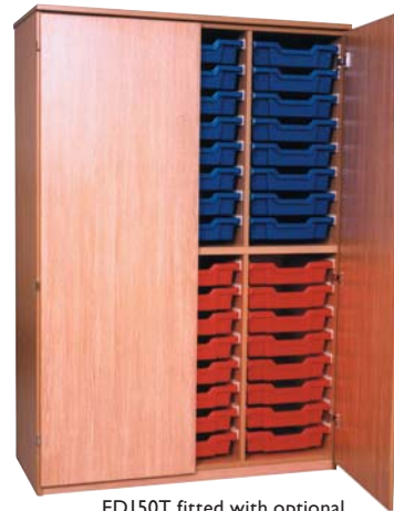
ED150T fitted with optional doors DR (P/PR)