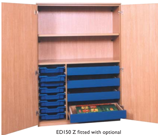
ED150Z fitted with optional doors DR (P/PR)